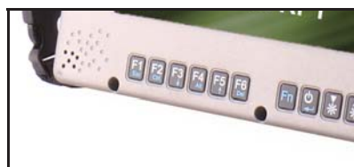
Programmable Function Keys