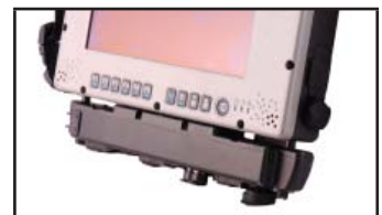
DockLite Port Expander

OPENTEC SOLUTIONS PTY LTD ABN 28 003 054 304 Unit 9, 1-3 Endeavour Rd, Caringbah NSW 2229 Australia Phone +61 2 9575 0925 Fax +61 2 9575 0999 Email sales@opentec.com.au