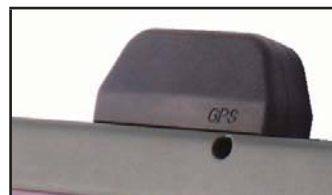
Optional Integrated GPS