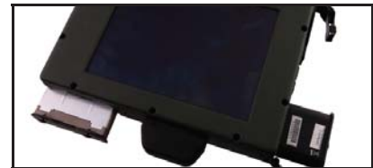
Removable battery & HDD