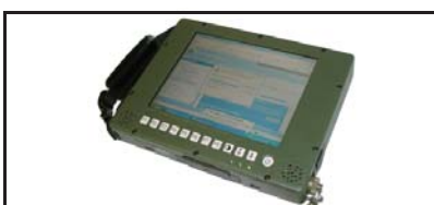
Industrial & Mil-Spec Models