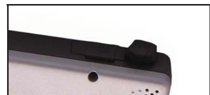
Double Sealed Ports